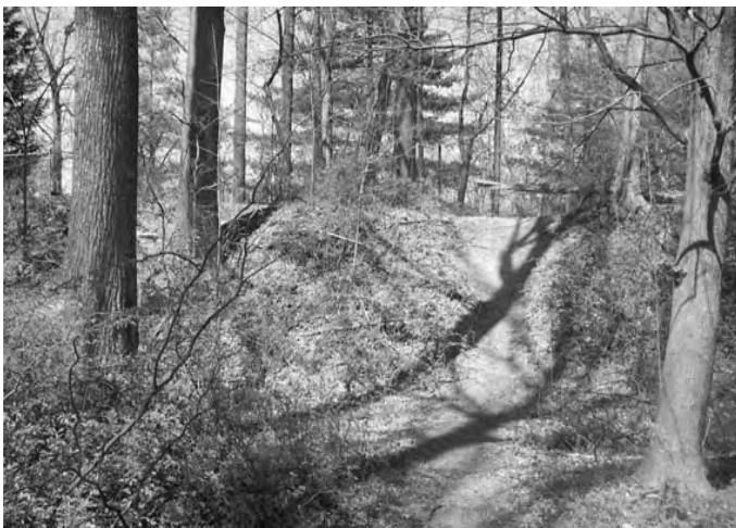
A "cut" in the line of the Unfinished Manassas Gap Railroad. Higginbotham Property, City of Fairfax.