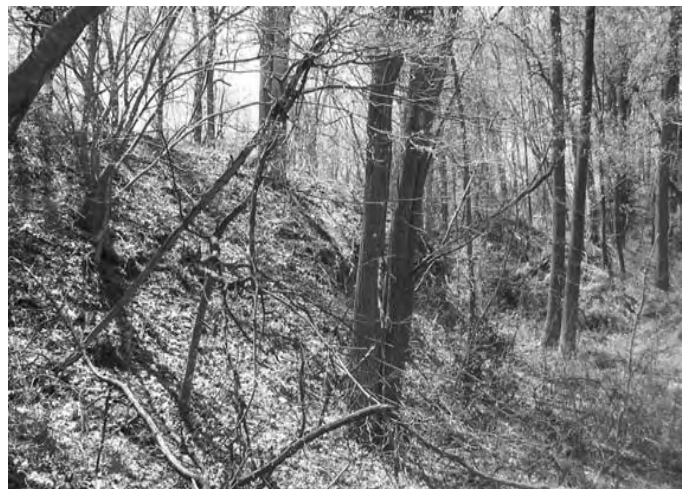
A remnant of the Unfinished Manassas Gap Railroad on the Higgenbotham Property (near Main St. & Judicial Drive)