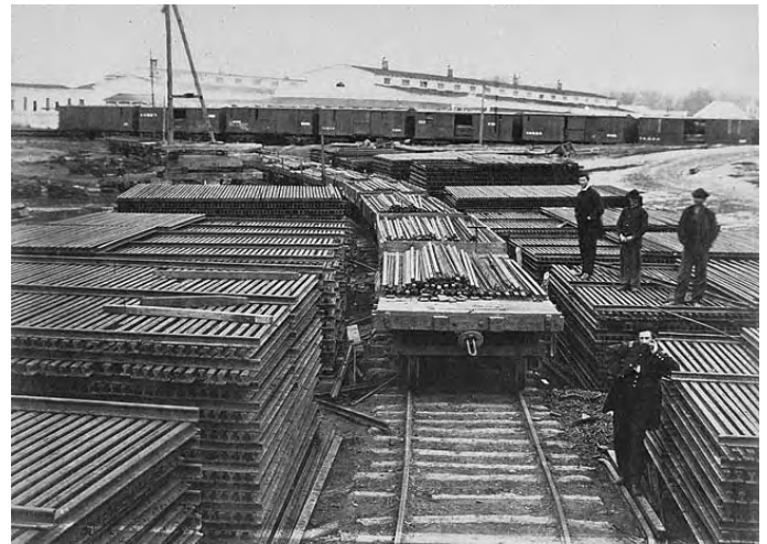
Rails for the Manassas Gap Railroad at Alexandria, VA, Waiting to be Delivered.