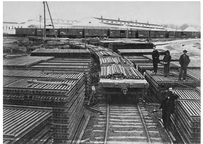
Rails for the Manassas Gap Railroad at Alexandria, VA, Waiting to be Delivered.