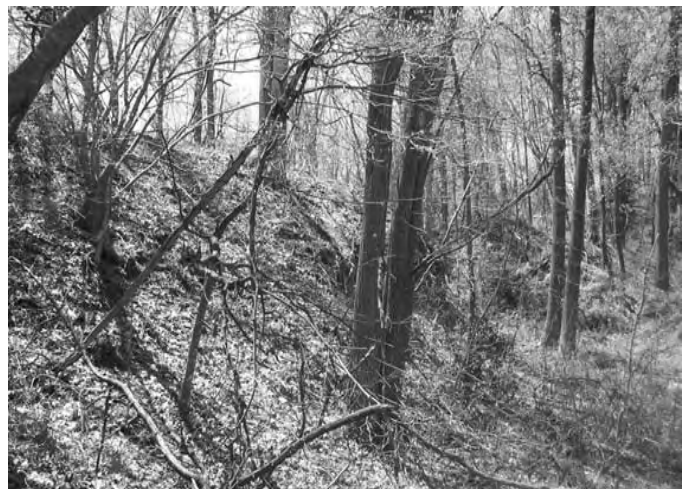
A remnant of the Unfinished Manassas Gap Railroad on the Higgenbotham Property (near Main St. & Judicial Drive)