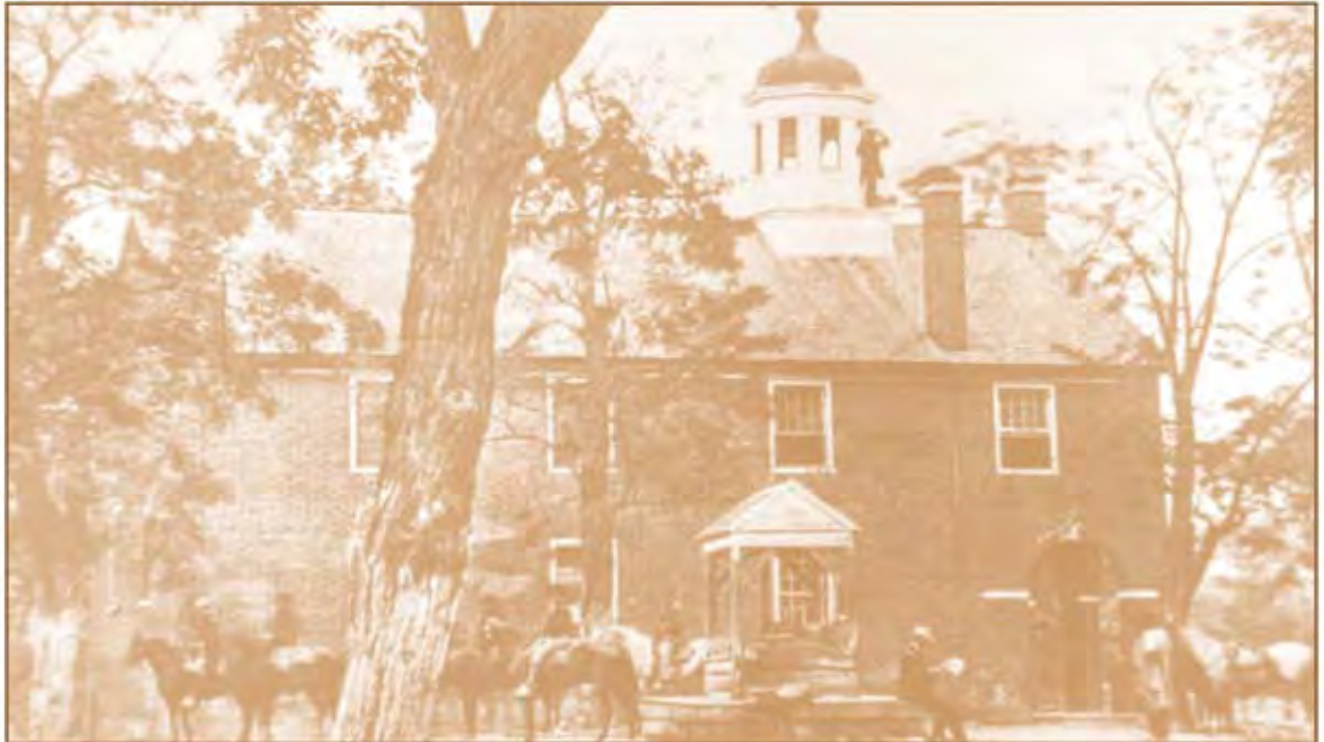
Fairfax County Courthouse.