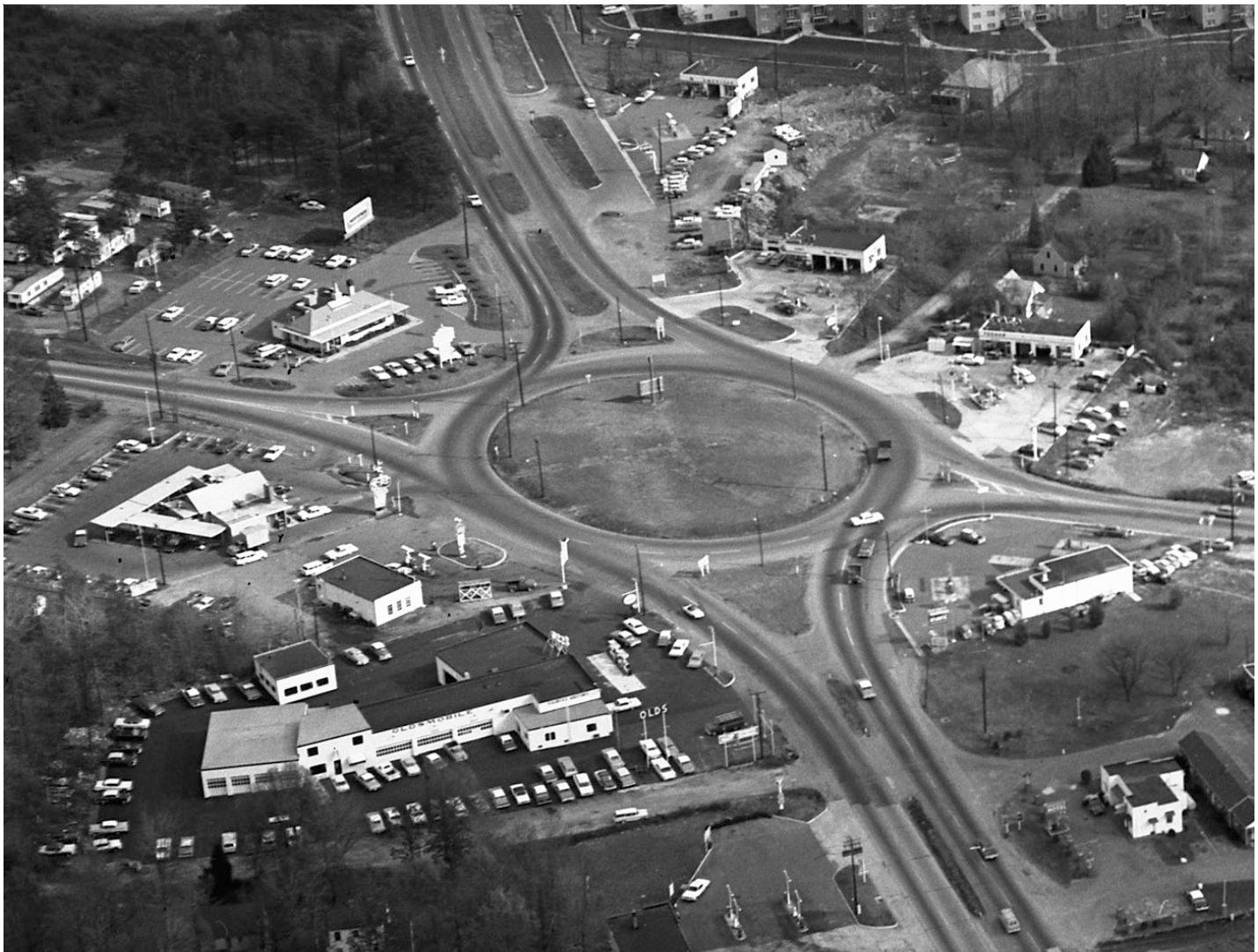
Aerial view of Fairfax Circle in 1963 looking east. Clockwise from the upper left: Pine Lawn Tourist Camp, Howard Johnson's Restaurant, Arlington Boulevard (Rt. 50), Circle American Service Station (top center to right of Rt. 50), Circle Esso Clinic (gas station), Fairfax Circle Texaco, Old Lee Highway (Rt. 237), Fairfax Circle Shell, Sweeney's Motel (lower right), Farrish Oldsmobile, Fairfax Glynn's Gulf Service Center, Tops Drive-Inn.

2 The McDonald's Restaurant at 10775 Lee Highway was the 200 th McDonald's and opened October 24, 1959. McDonald's Corporation.