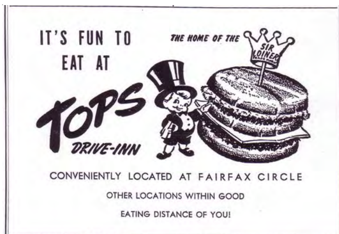
Advertisement in Fairfax High School Yearbook, p. 190, 1959.

window. As you might imagine, these locations were incredibly popular with high school teenagers. On Friday and Saturday nights each Tops location was mobbed, especially after a football game. I would go there too with my parents, who were barely out of their teens themselves. Tops Drive-Inn's were, to their generation, what the Mall is to today's teens.