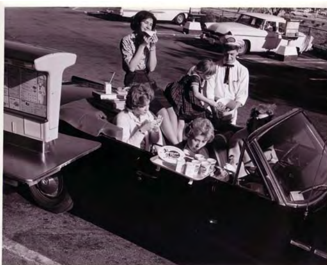
Typical scene at a Tops Drive-Inn. Note the Car Hop and the tray hanging from the car door.

a button on an intercom and phone-in their order directly to the kitchen. A Car Hop, either a young woman, or a young man, in uniform, would then bring the food out on specially designed trays that would hang from your car