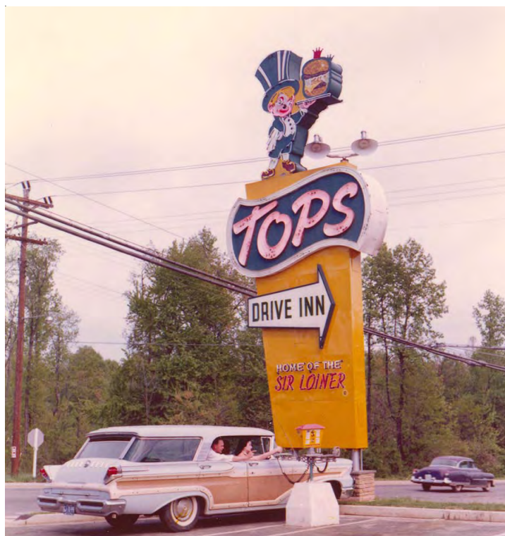
Unidentified Tops Drive-Inn location c. 1957. Also pictured, a 1957 Mercury Colony Park Station Wagon (foreground) and a 1953 Cadillac Coupe De Ville (background).

If you lived in Fairfax in the mid 1950's, your dining choices were very limited indeed. Among the few places you could go were the Come Rite Inn (c. 1930) downtown on Main Street, Howard Johnson's at Fairfax Circle (c. 1939), Vincent's Diner (c. 1942), or the 29 Diner (c. 1947) both on Lee Highway. However, these establishments