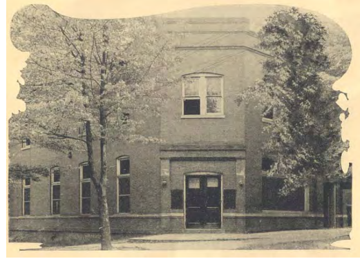
The National Bank of Fairfax Building c. 1905

to-do members, of the community served on the