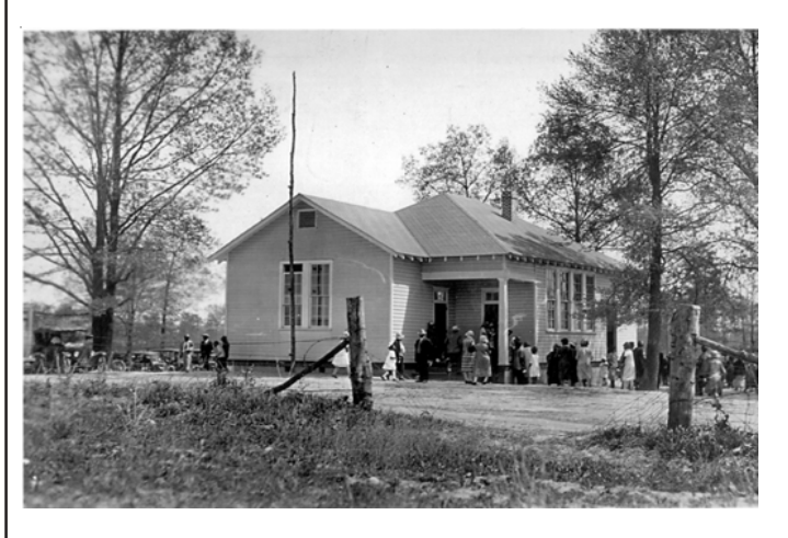
THEN: Fairfax Rosenwald School, Dedication Day, May 7, 1926.

FAIRFAX COLORED SCHOOL LEAGUE"<sup>24</sup>